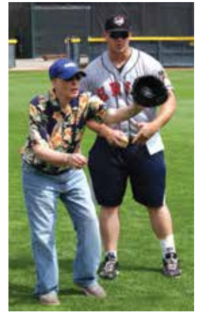
During the clinic for adults, Erie SeaWolves players and coaches demonstrated baseball fundamentals such as fielding, throwing, pitching and base running.