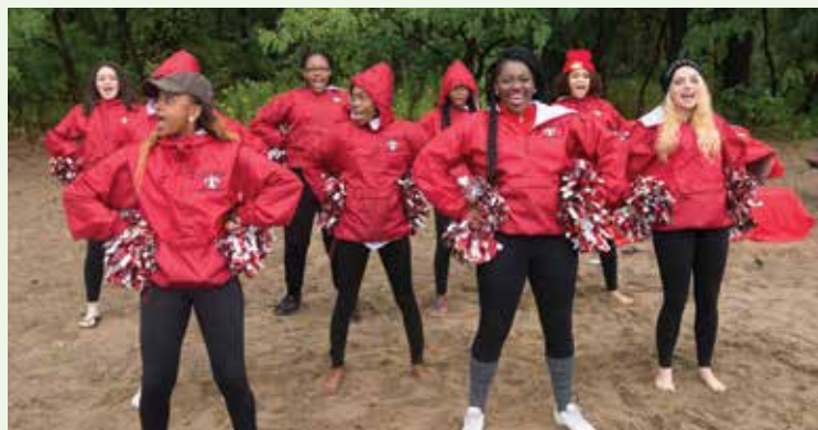
First Place Cheer Zone East High Cheerleaders encourage participants on Beast day.