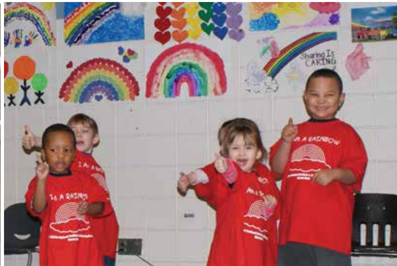
The gymnasium at the Barber National Institute is used for many activities including dance presentations, musical performances, fitness, and social activities for students and adults.

Every day, the Barber National Institute gymnasium is the site for gym classes and other recreational activities. As important as these are to students, the gym has come to mean so much more.