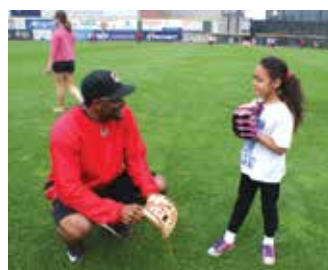
A young slugger takes a break with a team member.

In addition to the instruction provided at the Clinic, participants received a t-shirt, certificate and a ticket to an Erie SeaWolves game, where they were recognized on the field before the start of play.